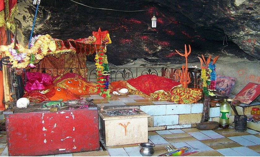
Sanctum of Hinglaj Mata Mandir, Balochistan