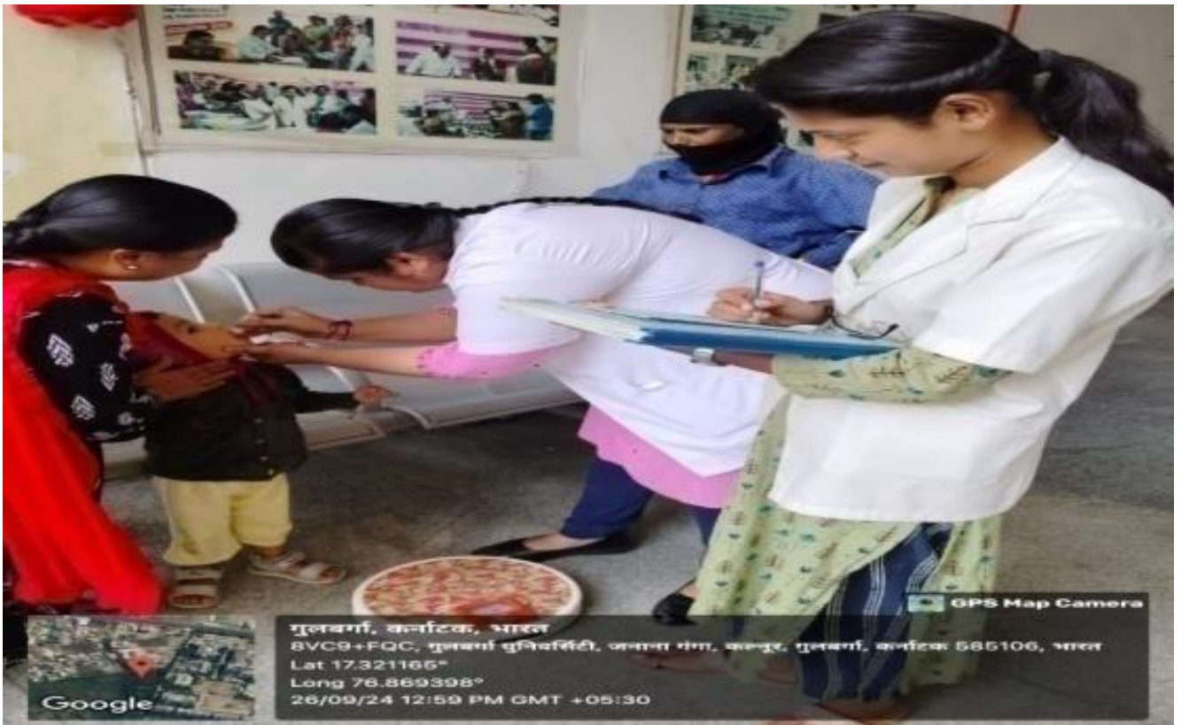
Monthly SWARNA PRASHA camp held in hospital